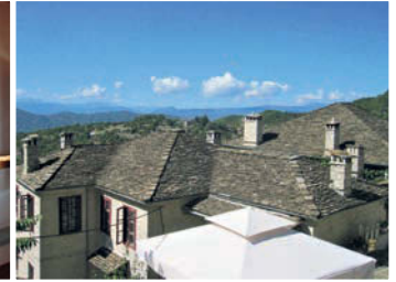
View from near Dias